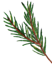
Australia's best Melaleuca alternifolia trees provide our high-quality T36-C5 oil.

Zap-it! products contain high-quality T36-C5 Melaleuca Oil , guaranteed to contain at least 36% terpinen and no more than 5% cineole. These compounds are beneficial to skin because they contribute to the oil's antiseptic and antibacterial properties.